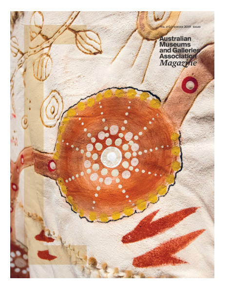
L-R: AMaGA Magazine Vol 27(2) Winter 2019, and Vol 28(1) Summer 2019

Branches and National Networks communicate regularly with their members through printed magazines, e-bulletins and newsletters. The Victorian Branch publishes INSITE quarterly for Victorian members. INSITE will not be published anymore from early 2020, as part of a communication refocus for the Branch.