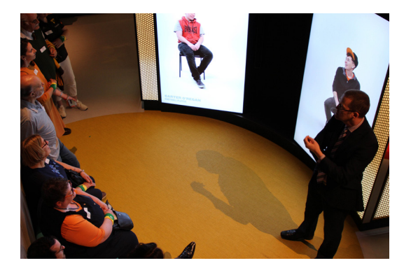
ABOVE Victorian members touring the newly redeveloped Australian Sports Museum.

The Branch provided mentor support to small organisations and ad hoc exhibition advice to members through their Exhibition Services team. This service will cease in 2020.